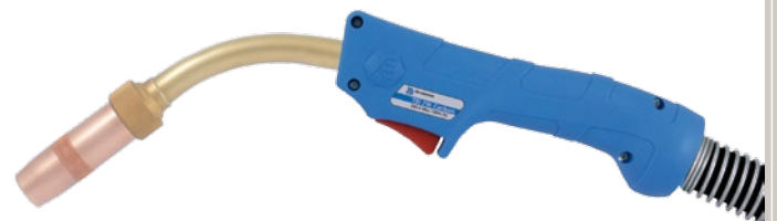
TBI 7W Carbon